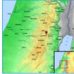
Zion and Region