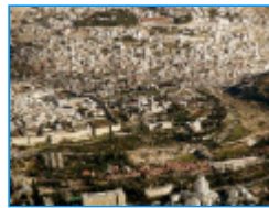
Mount Zion aerial from west